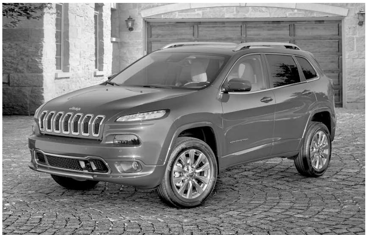
The Jeep® brand is introduced its new Cherokee Overland at the New England International Auto Show, expanding the brand's lineup to deliver consumers a new level of luxury combined with unmatched capability in the mid-size SUV segment.